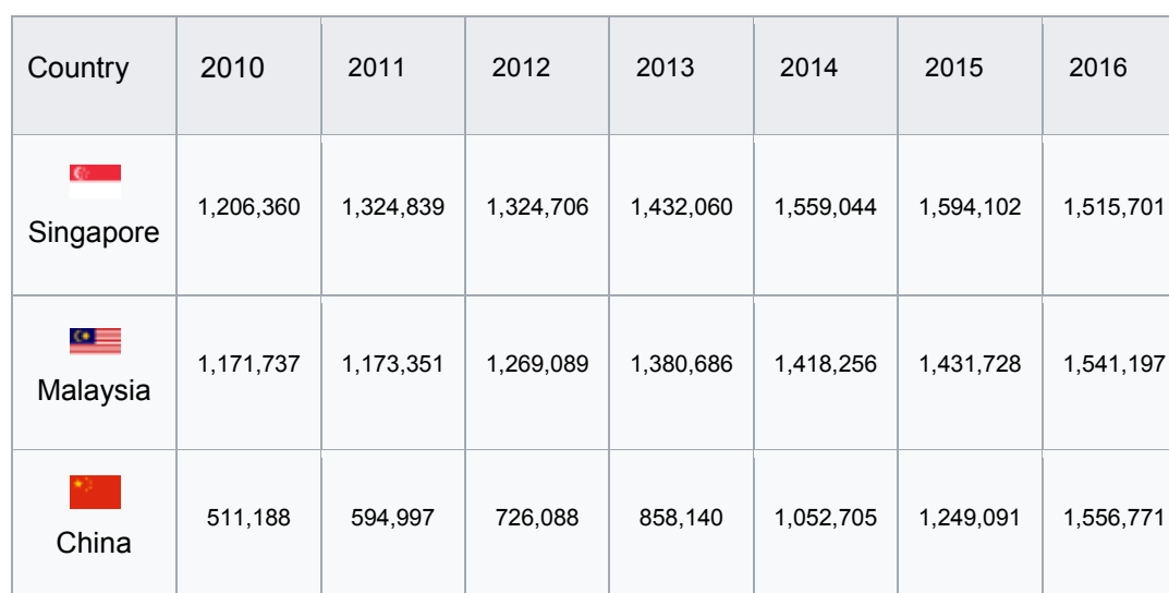
Figure 4.1 Foreign Tourist come to Indonesia

Singapore, Malaysia, and Thailand is Indonesian neighborhood country, its location is really close to Indonesia. If something going on in Indonesia, these Country will really fast get to know what is happening, since Indonesian and these country is member of ASEAN community. What's more about member of ASEAN community is they can travel easily from country to country with such ease without visa, this is a great potential for tourism industry as well, so these country without a doubt is a potential country.