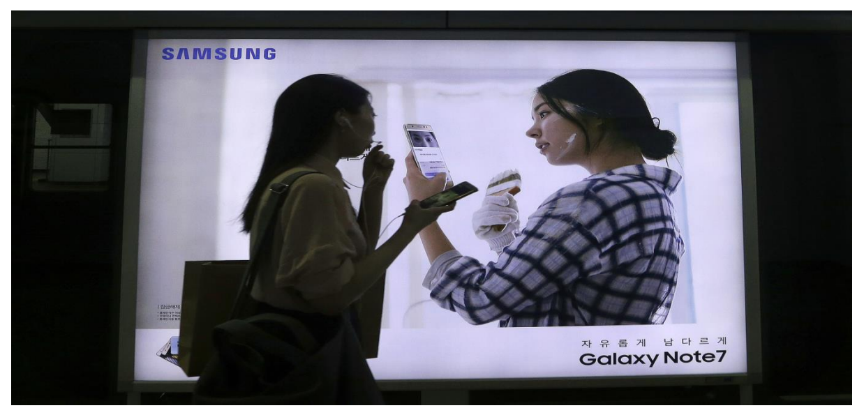
Figure 5: Samsung's Advertisement in South Korea

The screenshot above is from an advertisement for Samsung Galaxy Note in South Korea. While the advertisement does not have any verbal signs, it presents an image based on a pictorial sign. The denotation analysis of the advertisement suggests and reflects unique capabilities of the phone, but at the same time, the analysis reflects a more personalised meaning given to the phone. Samsung establishes the customer's emotional relationship with the brand because of the close association that relates to their emotional side. Hence, the use of semiotic advertising helps Samsung to develop emotional relations with its customers in the country.