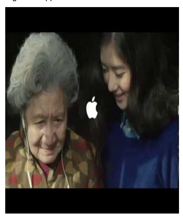
Figure 1: Apple's Advertisement in China

This screenshot is part of an advertisement of the Old Record commercial by Apple in China that was released in 2015 and shows a young girl letting her grandmother listen to an old song on an Apple product. The advertisement presents the sign of a family relationship. From a denotation perspective and an analysis of the advertisement, it reflects the use of an Apple product for listening to music and creating memories. However, the connotation analysis of the advertisement reflects the contributions of Apple in forming and strengthening family relationships. The sign refers to the fact that the brand is beneficial in strengthening family ties. As explained by Wenzhong and Grove (2010), China's culture exhibits а collectivist behaviour where people are close to each other and pay special attention towards personal relationships. Hence, it could be deduced that Apple's advertisement in China was consistent with the cultural behaviour and beliefs of Chinese consumers,