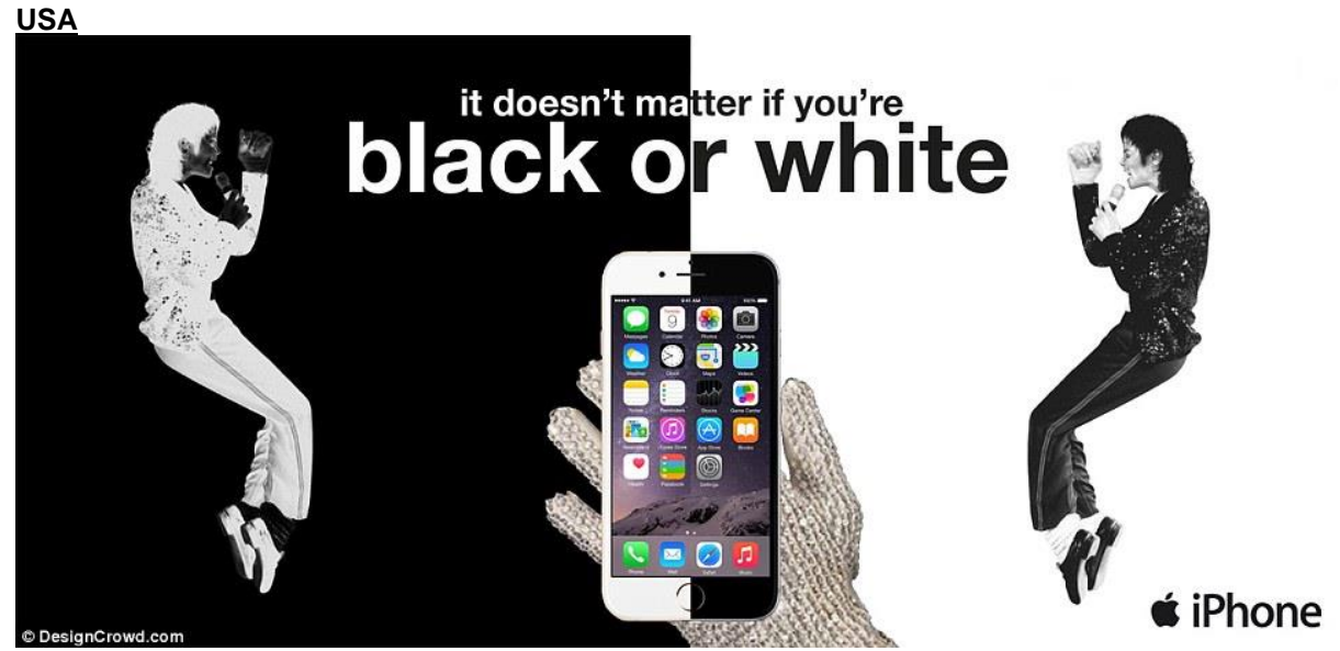
Figure 3: Apple's Advertisement in USA

Similar to targeting customers preferring pop-culture in South Korea, Apple's advertisement in the USA, as shown above, also targets customers who prefer pop culture icons. Americans are found to be closely associated with pop culture and pop culture icons, such as Audrey Hepburn for a long time. iPhone advertisements in the US, as shown above, present two meanings to the concept, whereby the direct meaning reflects sales of the phone in two colours, whereas the connotation meaning appeals to the consumer's pop-culture in the country. These findings confirm that Apple, the premium smartphone brand, does alter its advertisements based on the consumer's culture.