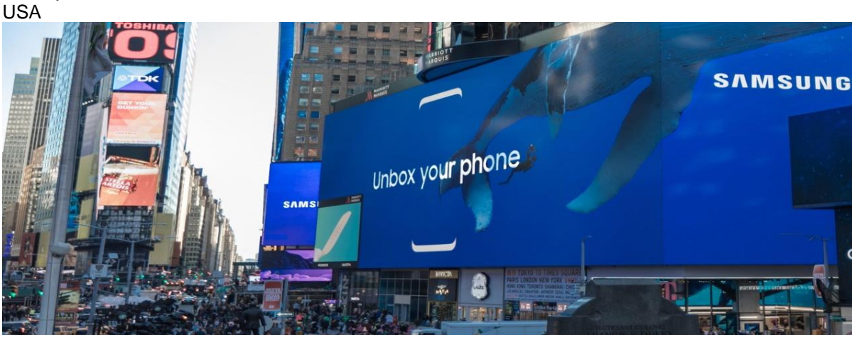
Figure 6: Samsung's Advertisement in USA

The screenshot above is from an advertisement for Samsung Galaxy Note in South Korea. While the advertisement does not have any verbal signs, it presents an image based on a pictorial sign. The denotation analysis of the advertisement suggests and reflects unique capabilities of the phone, but at the same time, the analysis reflects a more personalised meaning given to the phone. Samsung establishes the customer's emotional relationship with the brand because of the close association that relates to their emotional side. Hence, the use of semiotic advertising helps Samsung to develop emotional relations with its customers in the country.