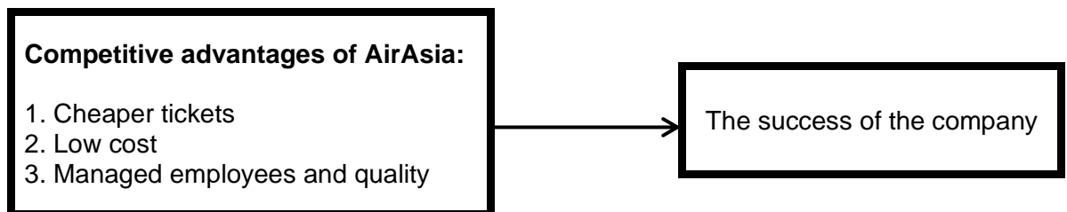
Figure 1.1 Research methodology

Using primary data from this questionnaire, the factors affecting dependent variable "success" were cheaper tickets, low cost, and managed employees and quality. This methodology is illustrated in Figure 1.1.