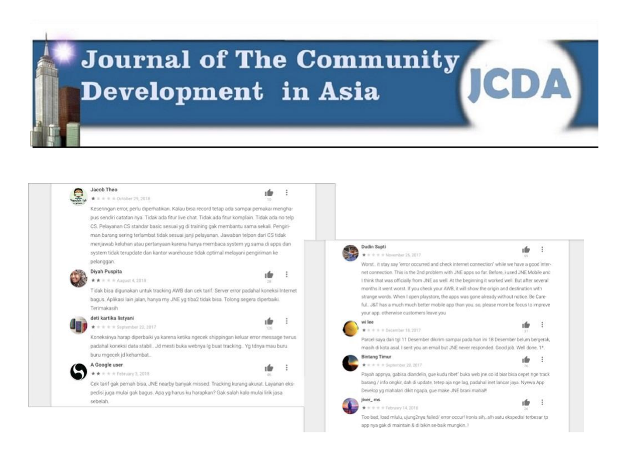
Figure 4: Reviews by My JNE App users on Google Play