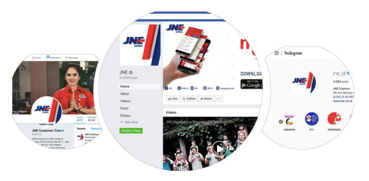
Figure 2: Digital promotion currently used by JNE Logistics.

The JNE Loyalty Card (JLC) is a free membership program aimed at JNE loyal customers. JLC holders get various benefits including – but not limited to – speed of service, discounted prices during the promo period, and attractive lottery-based rewards. Customers can easily enroll for the JNE Loyalty Card program by filling out an online form provided on JLC official website (<u>http://www.ilc.jne.co.id</u>). A JLC holder gets one point for every transaction worth IDR 25,000 at JNE. These points can be exchanged for attractive loyalty rewards or special discounts at a myriad merchant point-of-sale.