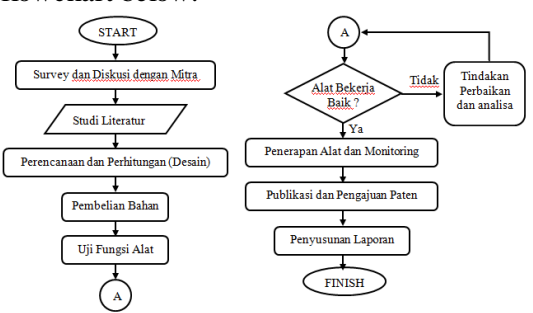
Figure 1. Flowchart Of Research Methods

To achieve the goal of this activity, then the methods used in manufacturing (HYDRA) Fish Dryers energy-efficient Hybrid System equipped ECU on the implementation of this Technology Student Creativity Program shown on the flowchart below.